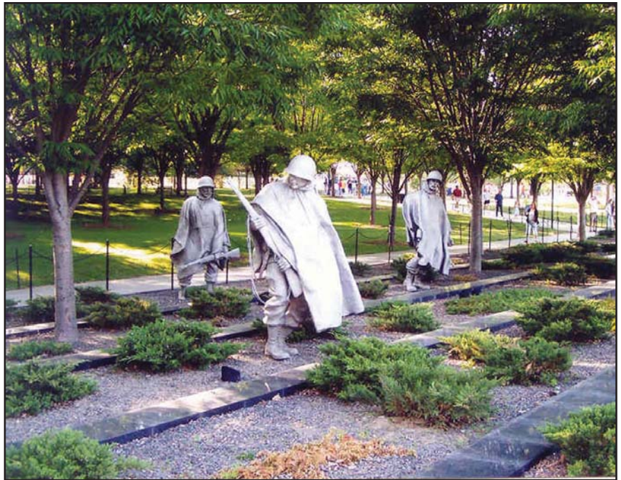
Korean War Veterans Memorial