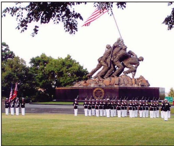
Iwo Jima Statue