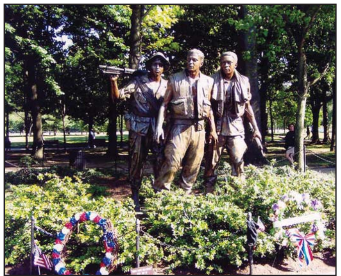
Vietnam Veterans Memorial

The Pickwick Electric Cooperative office will be closed on Monday, May 28, in observance of the Memorial Day holiday. Should there be an emergency, we will have standby crews available. Have a safe and enjoyable holiday.