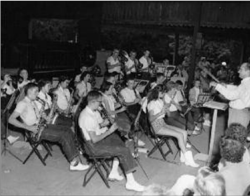
Selmer High School Band performs at a Pickwick Electric Cooperative annual meeting.